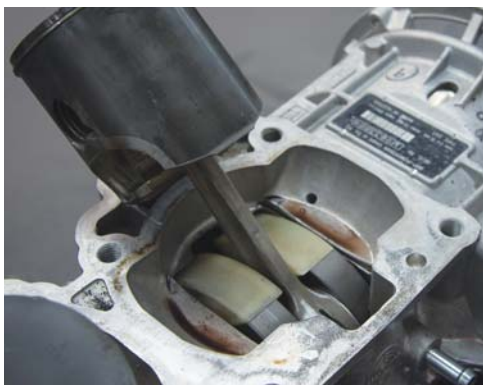
The pistons suffered only minor scuffing.