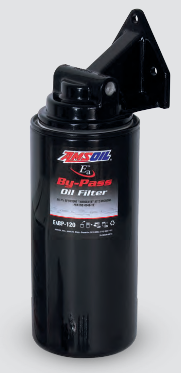
Fittings and hardware not shown

The Heavy-Duty Bypass Filtration System is constructed of high-quality cast aluminum with a steel filter spud that has been thoroughly tested in on-road and severe off-road service. The mount is finished with a thick layer of powder-coated paint to provide maximum resistance to the degrading effects of road salt, debris and engine-compartment chemicals.