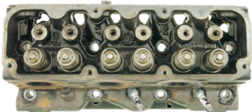
Cylinder head after cleanup with AMSOIL Engine and Transmission Flush. The valve springs and push rod openings are noticeably cleaner, with fewer sludge deposits. The manufacturer's stamping is more easily seen.