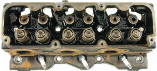
Cylinder head pre-cleanup. Note the sludge deposits on and around the valve springs and push rod openings.