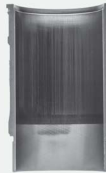
Severely Scuffed Liner