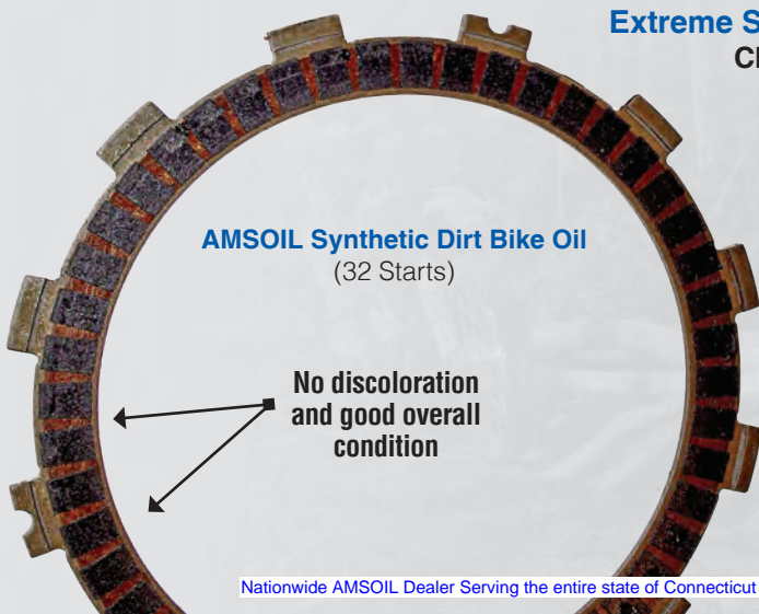
AMSOIL Synthetic Dirt Bike Oil (32 Starts)

No discoloration and good overall condition