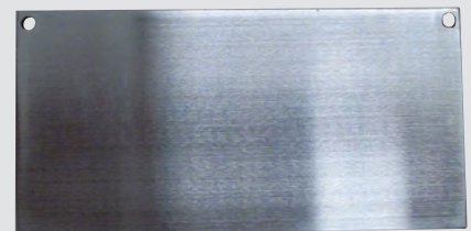
After 192 hours in a humidity cabinet, the metal coupon treated with Z-ROD Synthetic Motor Oil showed no signs of rust or corrosion.