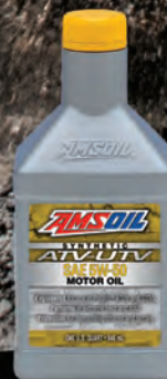
SYNTHETIC MOTOR OIL