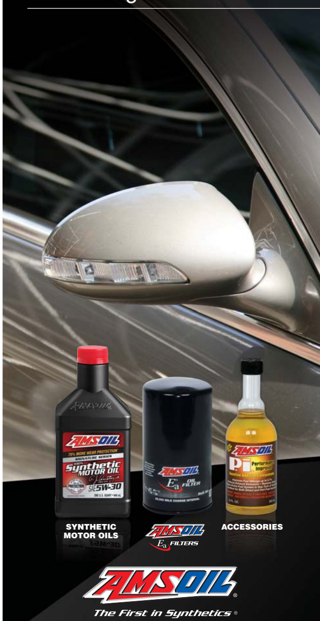
SYNTHETIC MOTOR OILS