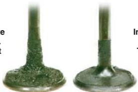
Intake Valve after P.i. Treatment