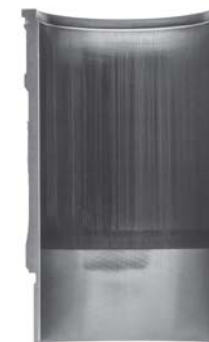
Severely Scuffed Liner