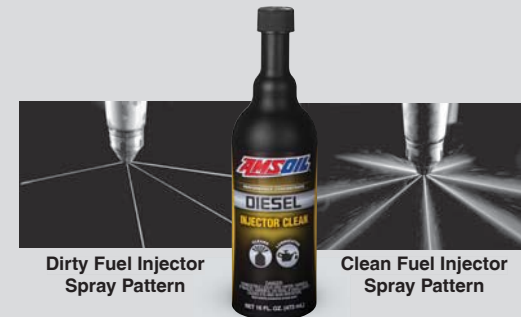
Dirty Fuel Injector Spray Pattern

Diesel Injector Clean also provides added lubricity, helping protect fuel pumps and injectors against premature failure.