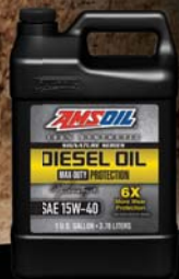
SYNTHETIC DIESEL OIL