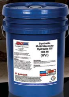
SYNTHETIC HYDRAULIC OIL